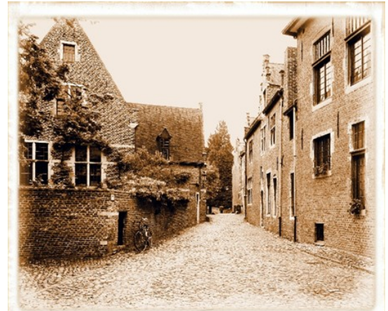
Stuart Irons—Homework Image